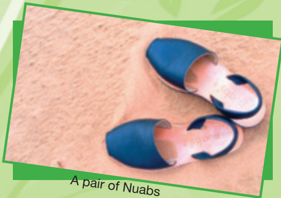
A pair of Nuabs