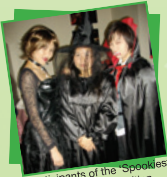
Participants of the 'Spookiest Dressed' competition

About 30 members of the MDIS Alumni had a spooky time at The Asian Civilisation Museum. The tour started off with the scary exhibits of death rituals of the ancient Asian society followed by a sharing session of the paranormal sightings by the Volunteers of Singapore Paranormal Investigation. Finally, alumni were invited to indulge in a widespread of buffet accompanied with ice cream and drinks. During dinner, the 'Spookiest Dressed' contestant was crowned and rewarded with vouchers as prizes.