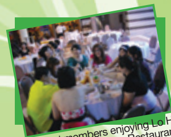
Alumni members enjoying Lo Hei Dinner at Kia Hiang Restaurant

From the Singapore Flyer's capsule, participants got a bird's eye view of the construction of the spectacular Marina Bay Sands by the Singapore River, F1 racing track, Esplanade and the upscale Marina district. The day ended with a scrumptious eight-course Chinese Lo Hei dinner at the Kia Hiang Restaurant.