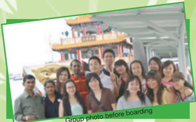
Group photo before boarding

As the ship set sail, they were served a scrumptious high-tea with a wide selection of pastries and savories with aromatic coffee and tea. At Kusu Island, alumni members visited the temple and strolled around the island enjoying the magnificent view of the sea. It was a tranquil and adventurous trip for all.